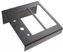
Triple Desk Stand