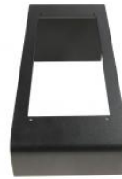
Single Desk Stand