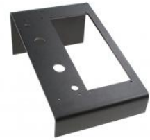
Dual Desk Stand