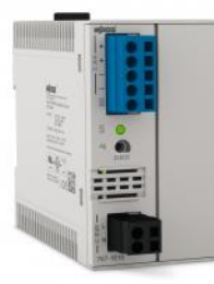
Power Supply 100-240VAC/24VDC 4A