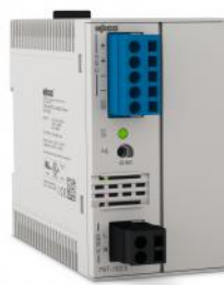
Power Supply 100-240VAC/48VDC 2A