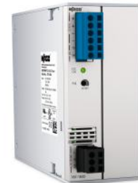
Power supply 100-240VAC/48VDC 5A