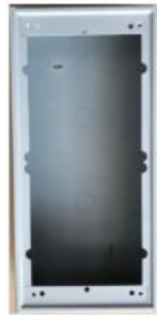
Wall-mount Backbox for Cleanroom Station